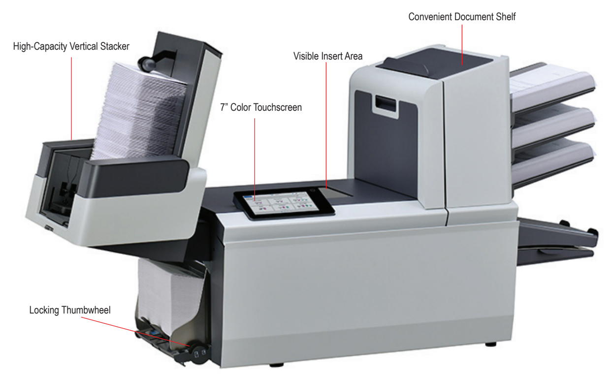
FD 6308-Standard 3 with High-Capacity Vertical Output Stacker