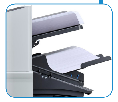
High-Capacity Production Feeder