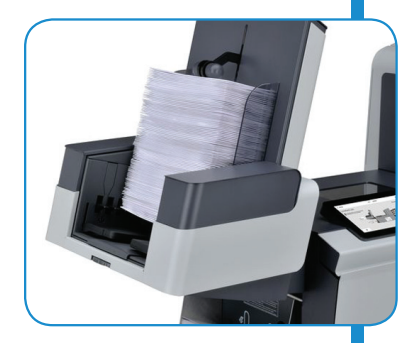
High-Capacity Vertical Stacker holds up to 500 filled envelopes