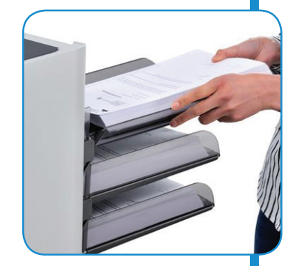
Easy to load document feeders